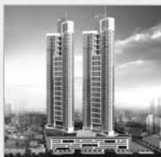
Orchid Heights, Mumbai

Pursuant to Clause 5A (g) of the Listing Agreement entered into between the Company and the Stock Exchanges, the details of shares lying in suspense account are as under: