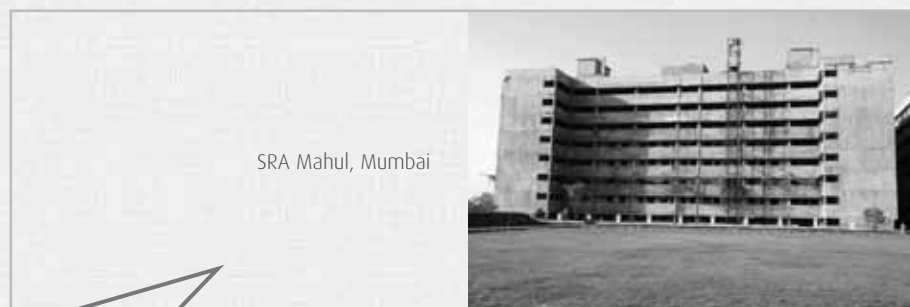
SRA Mahul, Mumbai