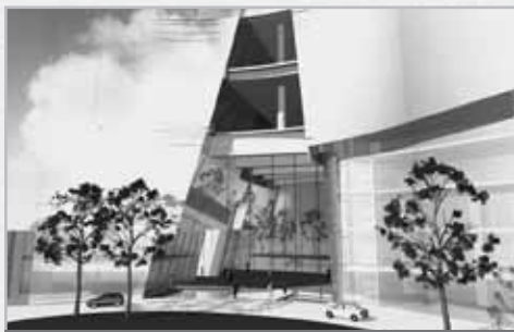
Adani Office Building, Mumbai