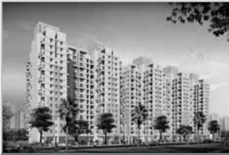
Orchid Ozone, Mumbai