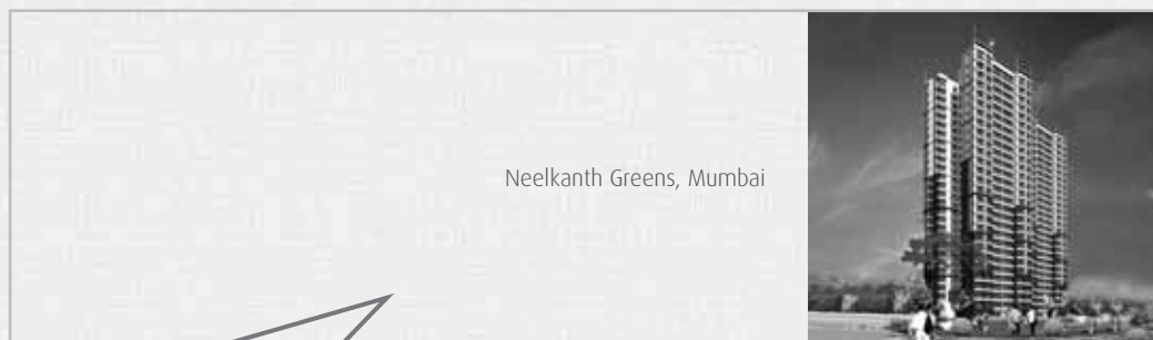
Neelkanth Greens, Mumbai