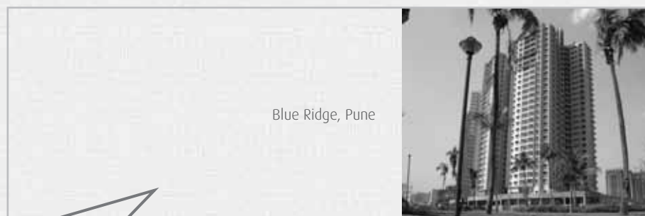
Blue Ridge, Pune