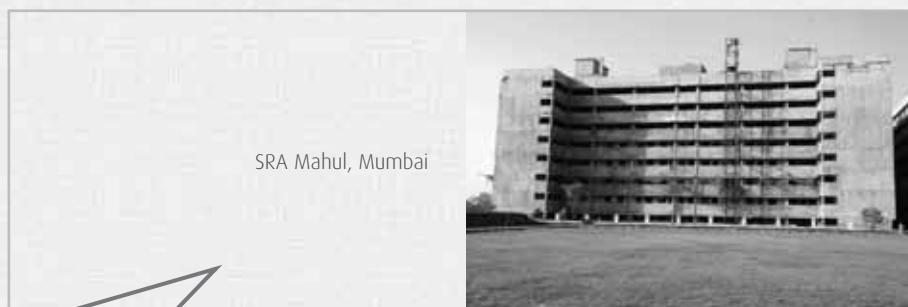
SRA Mahul, Mumbai