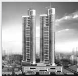
Orchid Heights, Mumbai

Pursuant to Clause 5A (g) of the Listing Agreement entered into between the Company and the Stock Exchanges, the details of shares lying in suspense account are as under: